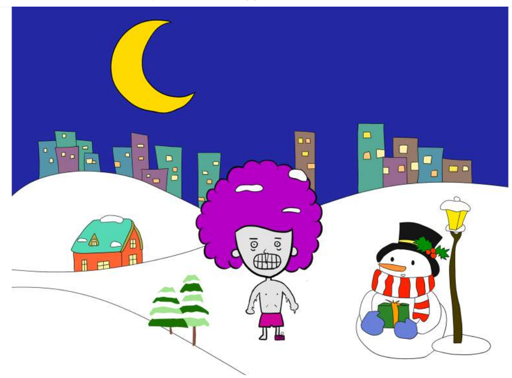
The Missing Shoe, by Class 2C

Once upon a time the Ranterino was very, very hungry. He wanted to eat some food but he had no food at home.